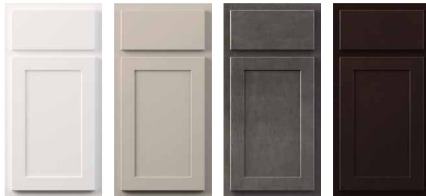
White Paint Pewter Paint Grey Stain Dark Sable Stain