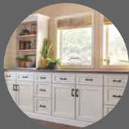
Kitchen & Bath

Find us on Instagram @ wolfhomeproducts for inspiration on your next project!