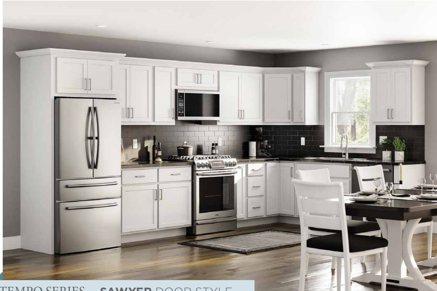
TEMPO SERIES - SAWYER DOOR STYLE

True to its name, Builders Mark™ cabinets offer designers, contractors, and builders ample design opportunities at an extremely affordable price point. The Tempo series — a collection of four popular finish options — is our renewed commitment to bringing you pocket-friendly style that you can trust.